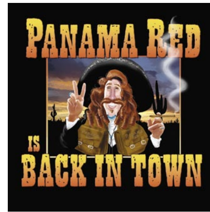
New Riders of the Purple Sage album cover created by Orion.

You may visit him at: citizensforawilderwest.com Or you can check out his surfer/cowboy album Beach Bums and Saddle Tramps at: cowhunarecords.com